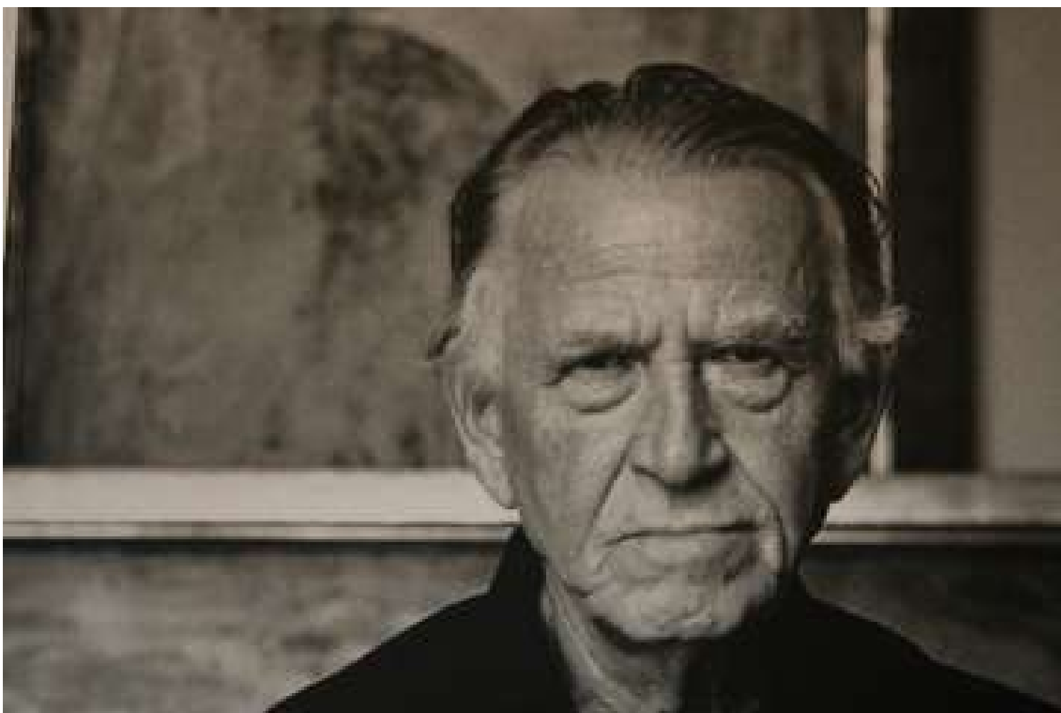
Ten Times Dix (Doc, 58 min., 2011)