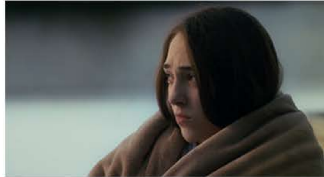
BRIANNA D'AGUZZO Deanna

Maša Lizdek was born in Vienna, raised in former Yugoslavia and migrated to Canada during the civil war. Maša is known for her guest star appearances on 'The Detail' (2018), 'Man Seeking Woman' (2015) and 'Murdoch Mysteries' (2013). Lizdek also starred in 'The Waiting Room' (2015) as Sanja (supporting lead), performing in Serbo-Croatian. The film was nominated and screened at Toronto International Film Festival, Locarno International Film Festival and several others.