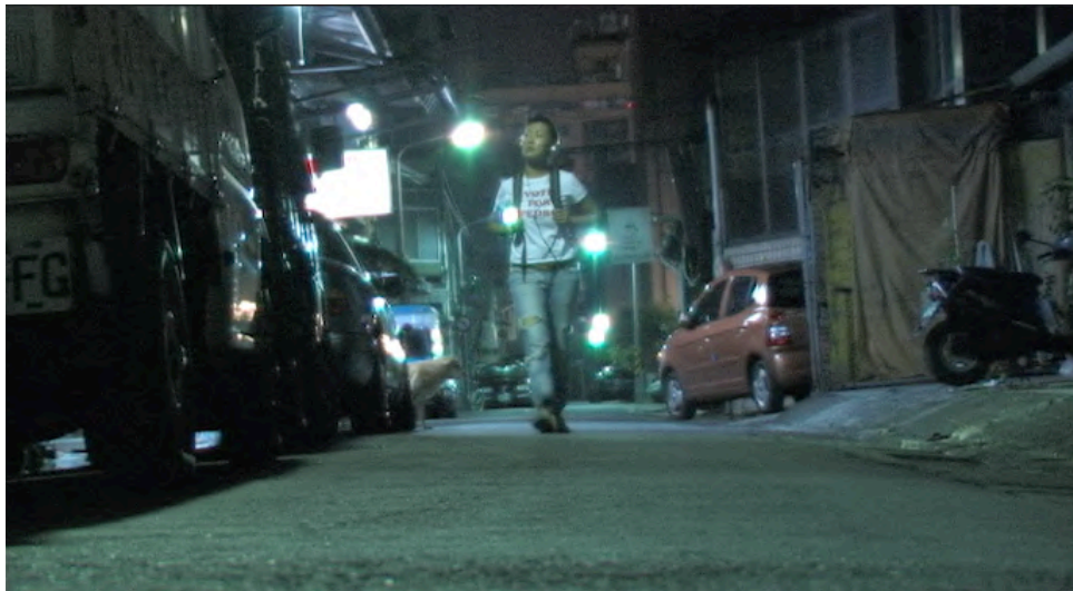
Taipei, Taiwan - 2005 First week of searching and getting to know Taipei City