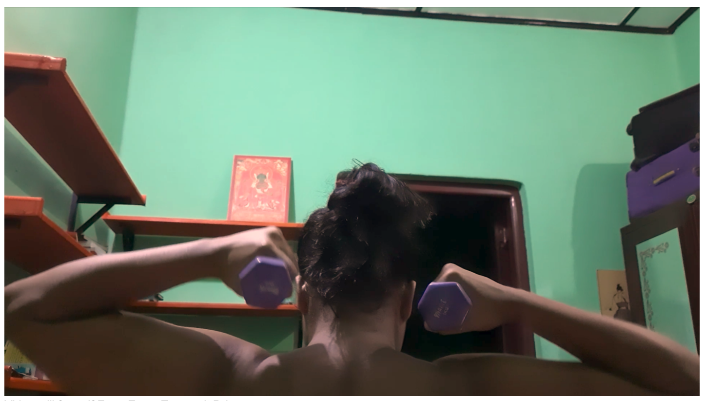
Video still from If From Every Tongue it Drips.